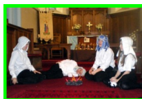
Holy Trinity Church - Christmas Carol Service