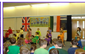
Red and Yellow and Pink and Blue...the children at Awsworth prepare to sing and dance.