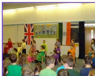
Red and Yellow and Pink and Blue... the children at Awsworth prepare to sing and dance.